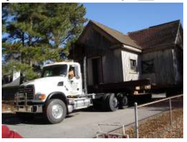
Did you miss the Waldo House move? Come to our March 25 program!

In partnership with the Town of Cary, the Friends were instrumental in saving the Waldo house. The Friends spent two weekends cleaning out two very large dumpster loads of trash from the house in 2006, preparing it for its upcoming move and saving Cary taxpayers about $1,500. Many other parties, including Capital Area Preservation, KB Bunn house movers, J&B Tree Pros, Time-Warner Cable, Progress Energy, BellSouth and local residents all cooperated to move this historic house, and dozens of people turned out to watch the move. As shown in the photo, seeing a house roll down Park Street isn't an everyday sight!