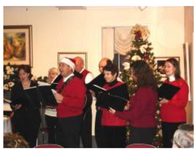
The Cary Concert Singers perform holiday favorites

The Friends held our annual holiday gathering at the Page-Walker in December and we were pleased and fortunate to enjoy the musical entertainment of the Cary Concert Singers .